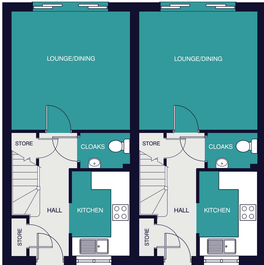
PEDLEY - PLOT 110