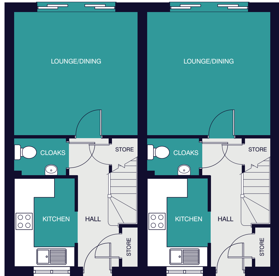
PINFOLD - PLOT 112